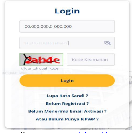
Figure 2 Login DGT Online

This report on the realization of final income tax borne by the government includes income tax payable on income received or obtained by the taxpayer, attached with an SSP or a printed billing code that has been stamped or written "Final Income Tax Borne by the Government of Ex PMK Number 44/PMK.03/2020" (in the case of there is a transaction with a tax withholder or collector). Reports and attachments must be submitted no later than the 20th of the following month after the end of the Tax Period. For Taxpayers who have met the criteria and are entitled to receive tax facilities for MSMEs in the Context of Handling the Covid19 Pandemic, the procedure for applying for facilities The tax returns are as follows, the taxpayer submits an Application for an MSME Certificate (Suket PP 23/2018). The submission can be done in two methods, namely online and manually, with the following explanation, the Taxpayer accesses the www.pajak.go.id page by the login stage at DGT Online. Fill in your taxpayer identification number and password. After that u fill in the security code (captcha):